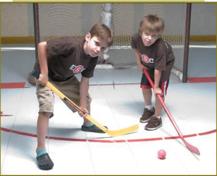
Escondido Floor Hockey Recreation Program