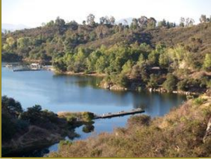
Escondido's Dixon Lake (above)

Periodically review and modify funding sources to assure their adequacy to cover the maintenance of parks.