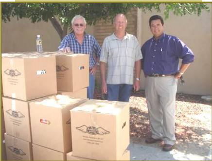
Escondido Grand Avenue Farmers' Market (above)