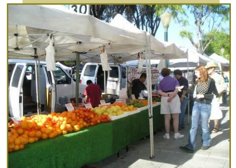
Escondido Recreation Program (above)