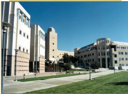
San Pasqual High School Escondido High School District (above)

Work with school districts to explore the use of existing smaller sites in urban areas to accommodate lower enrollments and/or higher intensity facilities (multi-story buildings, underground parking, and playgrounds on roofs, etc.).