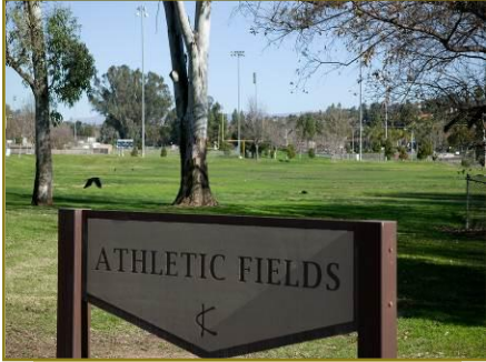
Kit Carson Regional Park

Urban Parks (<2 acres and Linear Parks) respond to their surrounding urban environment by incorporating features that provide a sense of open space in a compact setting (Figure V-4). Urban Parks include a high percentage of solid surface areas to compensate for a higher frequency of use. Features include a mix of active and passive features for all ages such as raised landscaping, water features, seating, picnic areas, tot lots, exercise courses, and areas for small-scale sports activities (e.g. horseshoes, volley ball, shuffleboard, etc.).