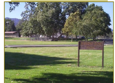
Escondido Aquatics Program (above)