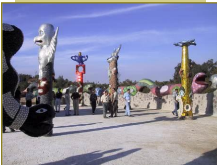
Queen Califia's Magical Circle Kit Carson Park Artist: Niki de Saint Phalle

Cultural enrichment's role in enhancing community health provides additional financial benefits by promoting tourism and economic revitalization. Escondido recognizes the benefits of public art and is home to the California Center for the Arts, Escondido, as well as several world-renowned sculptures and public art displays. General Plan policies support cultural enrichment in the community and the opportunity for artists to contribute their theatrical, conceptual and practical skills.