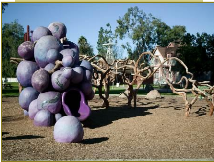
Grape Day Community Park