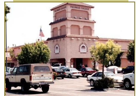
Palomar College, Escondido campus

Encourage and support the development, expansion, and upgrade of higher education facilities such as the Palomar Colleges, California State University San Marcos, and private universities.