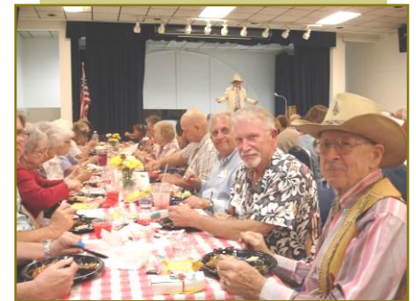
Joslyn Senior Center Volunteer Appreciation Luncheon

Civic engagement and volunteerism allow residents to take an active role in addressing local challenges which are important facets of a healthy community. Citizens involved in local decision making are more likely to understand and appreciate the needs of all members of the community. Civic engagement includes volunteering in the community, and participating on committees, boards, or commissions. Without volunteers the city would not be able to provide the level of service required to reach all its citizens who are in need. The General Plan promotes civic engagement and encourages residents to actively participate in Escondido's future.