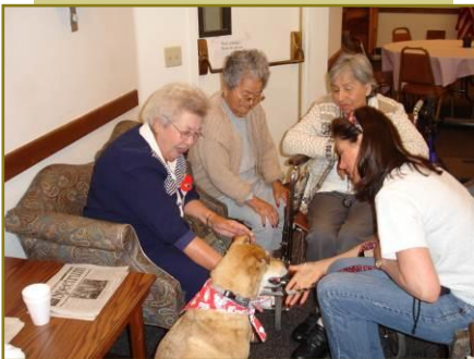
Pet Therapy for Elderly Residents at Jocelyn Senior Center

The city acknowledges that the older adult population of ages 50 and over is increasing faster than other age groups. Disabled and disadvantaged residents face challenges that require unique solutions. In recognition of the number and diversity of needs, the General Plan includes policies addressing the need for accommodating adequate services and programs to ensure the health and wellness, safety and protection of older adults, as well as disabled and disadvantaged residents. Figure V-14 provides a summary description of facilities that serve older adults, disabled and disadvantaged residents.