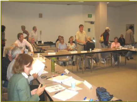
Escondido General Plan Citizens' Committee Meeting

Distribute information about community events to a wide range of community organizations such as churches, senior facilities, and schools using existing city-sponsored platforms (e.g., city website and public access television).