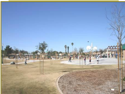
Grove Neighborhood Park