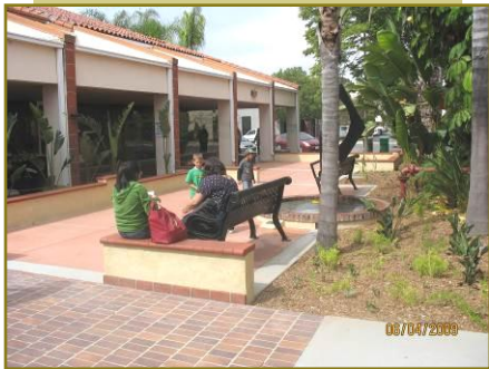
Escondido Public Library Downtown Main Facility