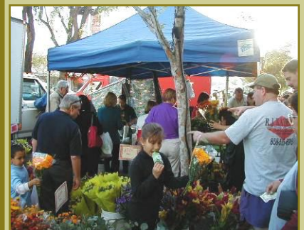
Escondido's Farmers' Market